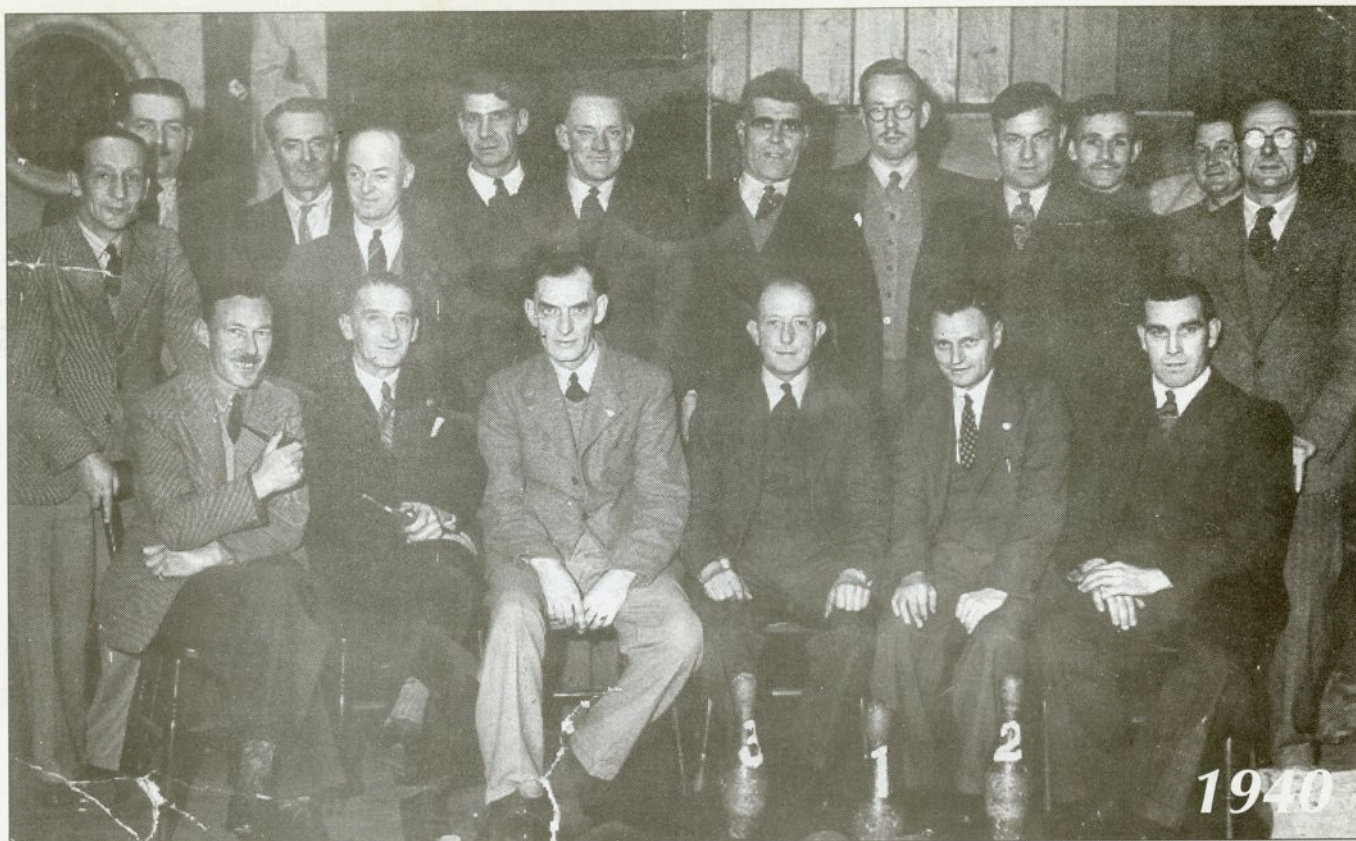
Ties and Brylcream - Painter Bros Skittle Team were photographed by the Gloucester Journal some time in the 1940s at the Old Black Swan in Widemarsh Street, the black and white building which was sadly pulled down before its time.