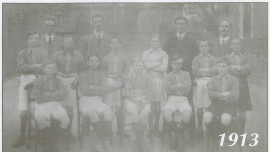
Furious footballers Holmer School did well in the Herefordshire Schools Challenge of 1913 1914 winning ten of eleven matches played and scoring 86 goals while only letting six through. The semi final was against St Owens and the score? 10 - 1 to Holmer. Better luck next time, lads.

Some of the Credenhill buildings were later used to accommodate people and at the end of the Second World War the shells were taken to Abbey Dore and Ewyas Harold for dismantling. The explosives were destroyed under controlled conditions on Ewyas Harold common.